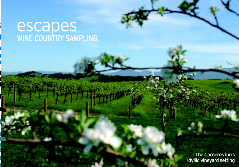
The Carneros Inn's idyllic vineyard setting